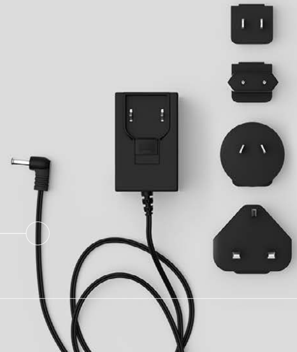
Universal Power Supply